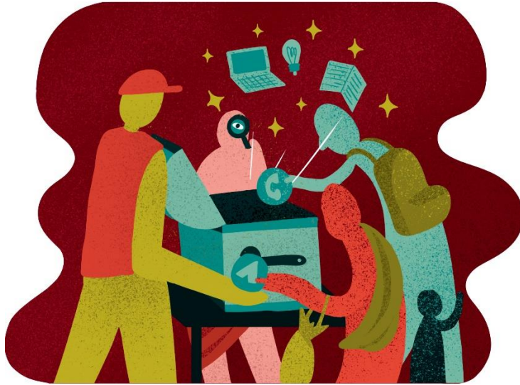
Illustration 8 Capacities and learning