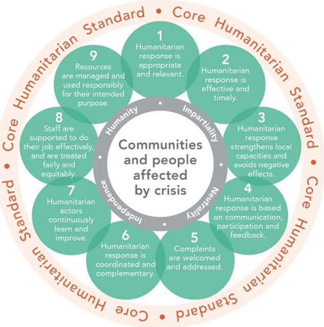
Figure 2 The Nine Commitments of the Core Humanitarian Standard

Commitment Four is mostly centred on organisations making information on their activities available to people affected by crisis, receiving feedback, and engaging people throughout all stages of the project cycle. Commitment Five focuses on receiving information through people’s feedback. Commitment Three focuses on the humanitarian response to strengthening local capacities and avoiding negative effects was indirectly touched upon (Core Humanitarian Standard Alliance et al. 2015).