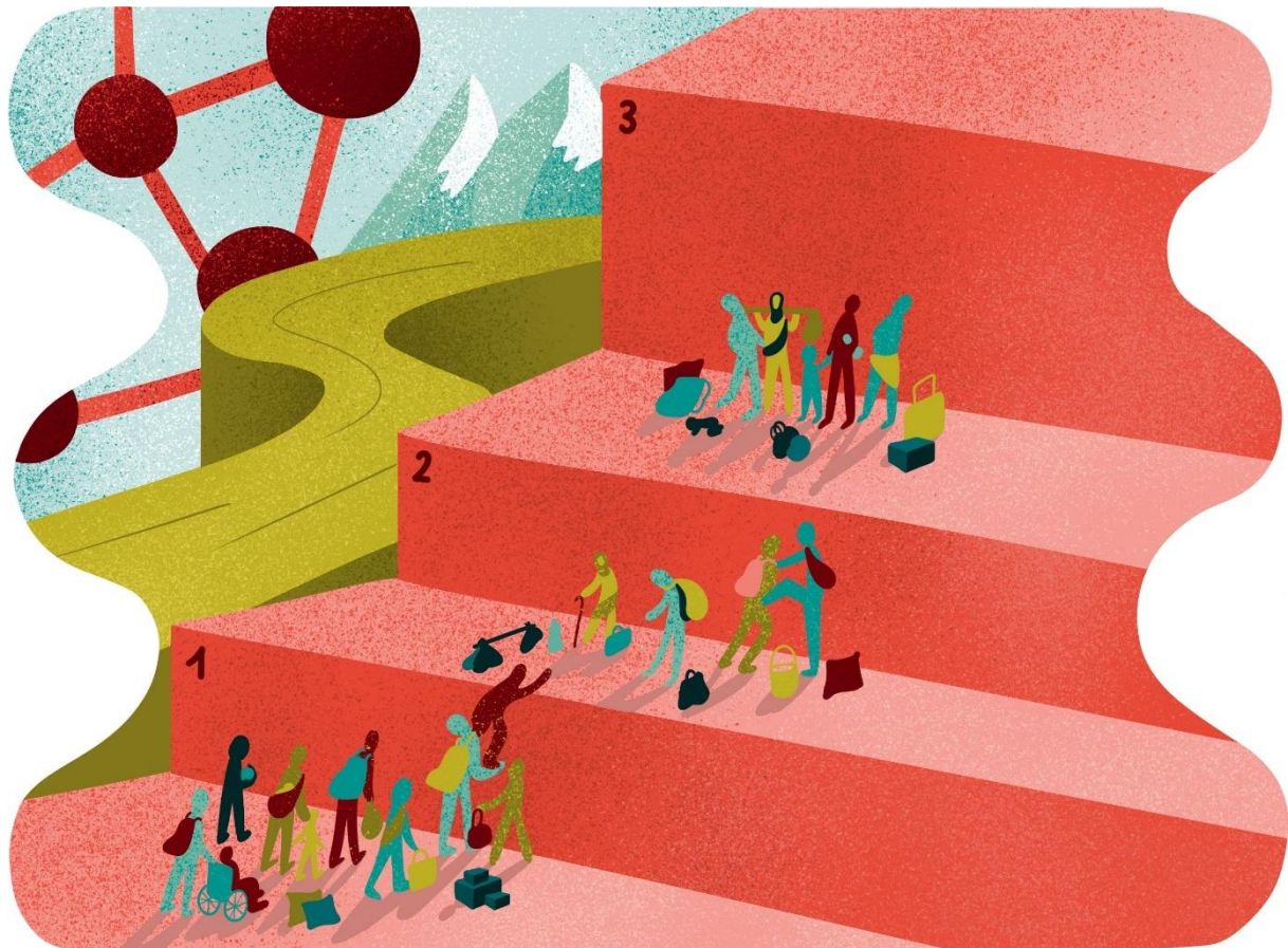
Illustration 5 Affected people face challenges

decision-making is meant to lie with the business, organisational risks informed by cybersecurity and compliance seemed to be more important.