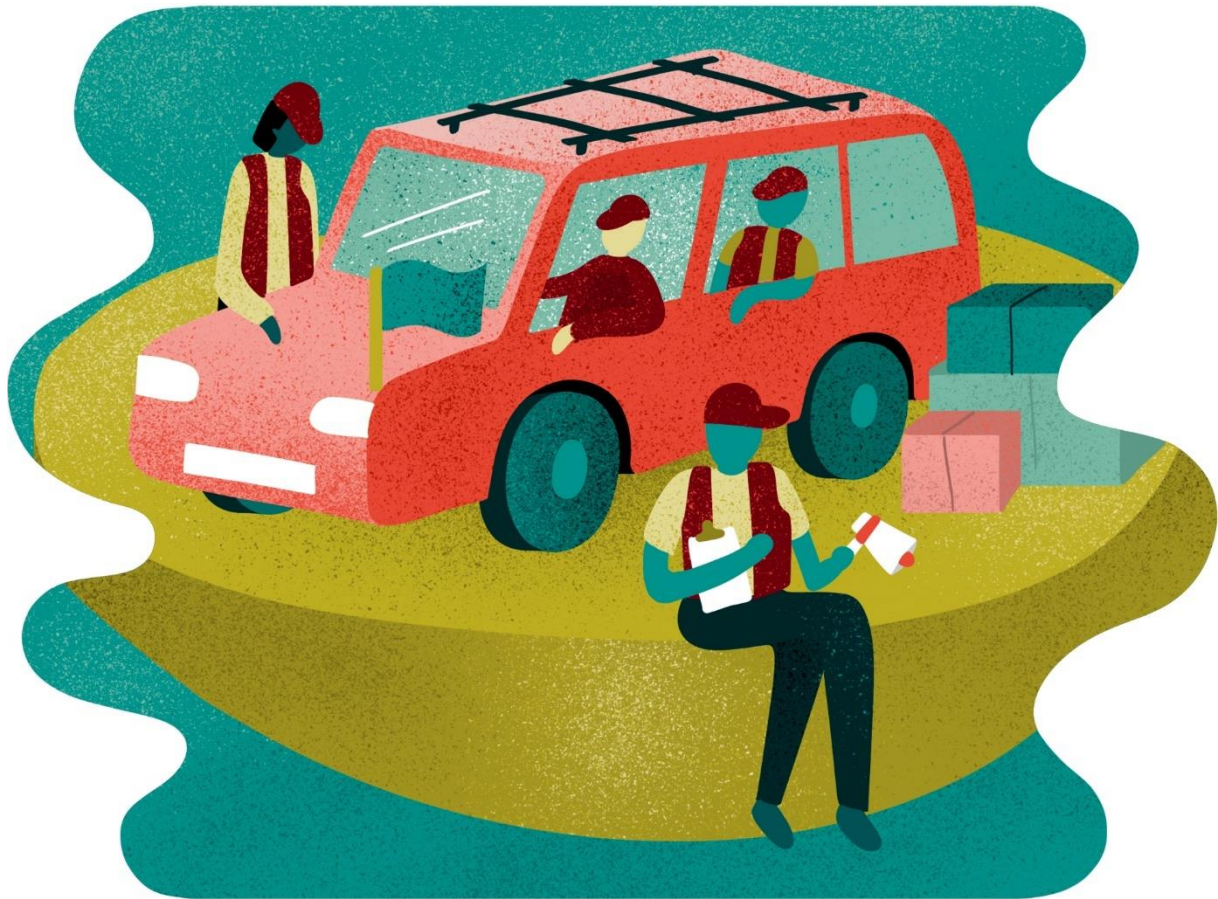
Illustration 2 Humanitarian actors prefer traditional ways of communication

Digital technologies are widely considered as having the potential to enable effective aid and service delivery. By using digital tools and communication channels to share information, provide feedback, and submit appraisals, data becomes the “currency of digital transformation, driving changes to systems for decision-making and service delivery” (Global Partnership for Sustainable Development Data 2022, 11). However, the downside of technological shifts is the massive amounts of personal and non-personal data on affected people collected without proper use, deletion, or erasure, which poses potential privacy risks. While these risks might not be new, they impose new trade-offs and real-time challenges for humanitarian stakeholders and affected populations, such as data breaches, misinformation, and disinformation (Martin et al. 2022; Vinck et al. 2022; Hilhorst et al. 2021; Madianou 2019; van Solinge 2019; Willitts-King et al. 2019; Jacobsen et al. 2018; Madianou et al. 2016).