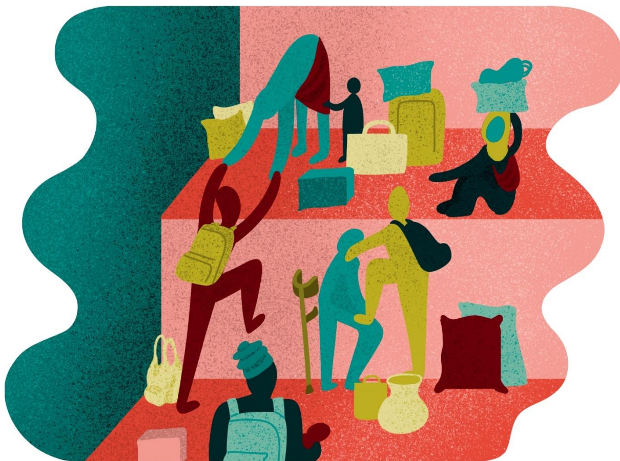
Illustration 1 Affected people climb the ladder of participation

There are several factors that motivate the adoption of digital tools for participation and accountability. On the one hand, affected people are increasingly using interactive communication technologies such as social media platforms and mobile messaging apps to communicate with each other, local partners, and others. As a result, it feels obvious that they expect humanitarian organisations to employ the same technologies. On the other hand, increased awareness about data protection and privacy risks raises ethical questions around data and digital literacy and increases the imperative of data rights to ensure 'doing no digital harm'.