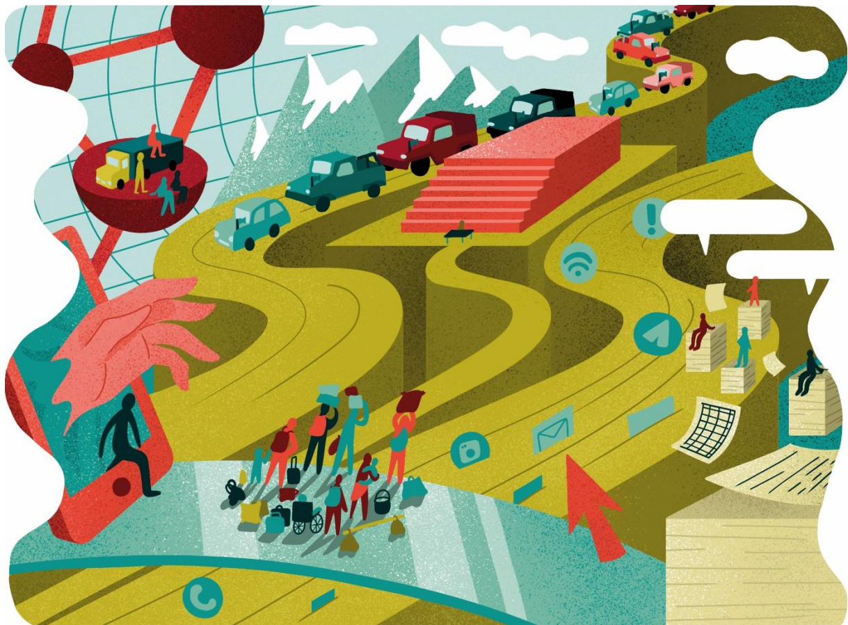
Illustration 4 Affected people set off to their digital journey

Humanitarian organisations use digital technologies to engage with people, and increase accountability, and share real-time information to make people’s voices heard. Interactive tools such as social media and mobile messaging apps alongside digital platforms for managing feedback data continue to be on the rise. According to Lough (2022), “social media is likely to play an increasingly