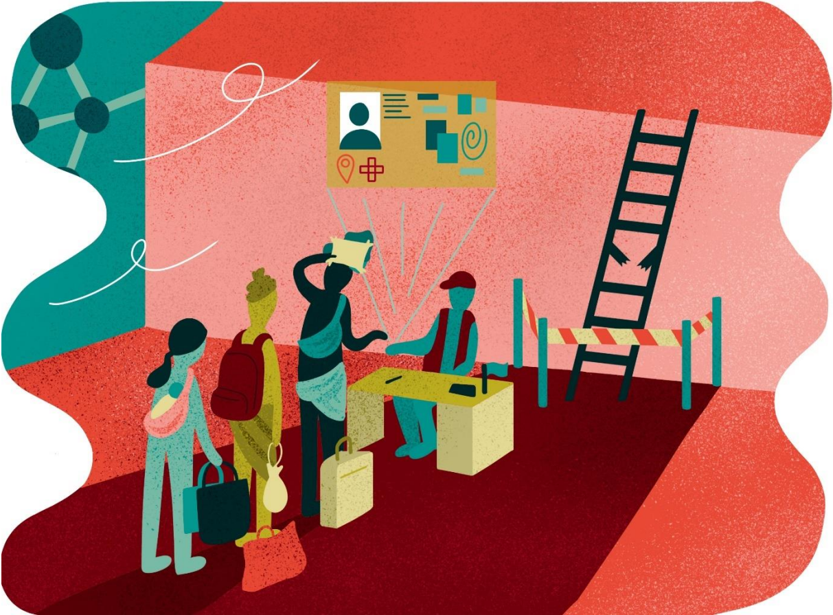
Illustration 6 Affected people share their data for aid

In the digital humanitarian context, legal accountability mainly refers to compliance and different data protection and privacy regimes, including national and regional legislation such as the European General Data Protection Regulation as well as local laws which may apply and organisational compliance systems. While non-governmental organisations are bound to such laws, international organisations are generally exempt and claim to follow best industry standards, such as General Data Protection Regulation and others. Most of the interviewees considered the collection of consent as a good practice to increase accountability. While consent is an important cornerstone of data protection and data governance, “it is increasingly viewed as insufficient on its