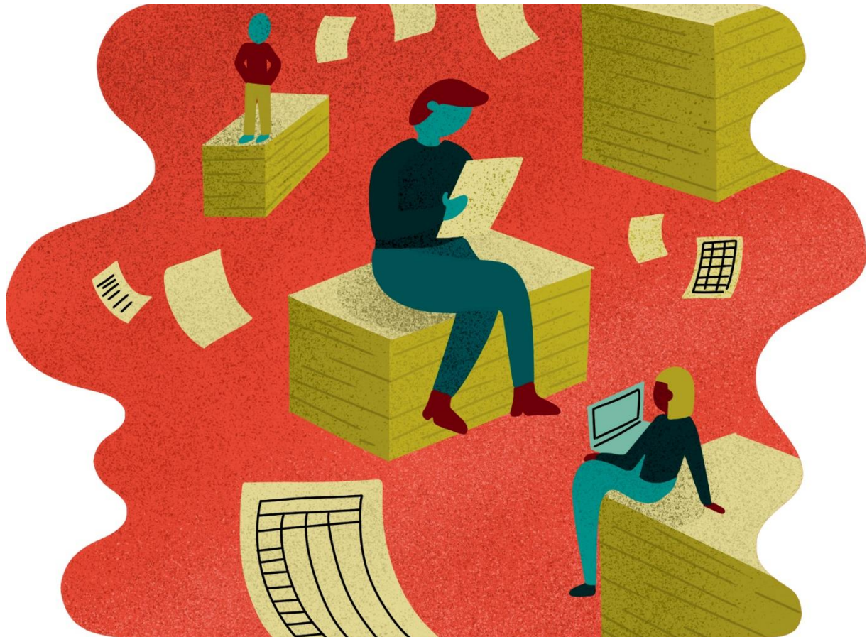
Illustration 3 Donors request evidence

As a result, interviewees shared that very often data is used inefficiently, resulting in lost funding, limited analyses, and learning, fractured data ecosystems, large administrative overheads, and missed opportunities to replicate the solution for the organisation or the sector as a whole. To these interviewees, short funding cycles, audit requirements, and competition amongst humanitarian organisations drive the sector's digital digitalisation more than ethical considerations toward a more principled approach to technology and digital accountability. Consequently, offline processes are transferred to a digital environment without sufficient risk analysis, often replicating offline problems in an online environment. In this way, learnings for longer-term change and transformation are lost.