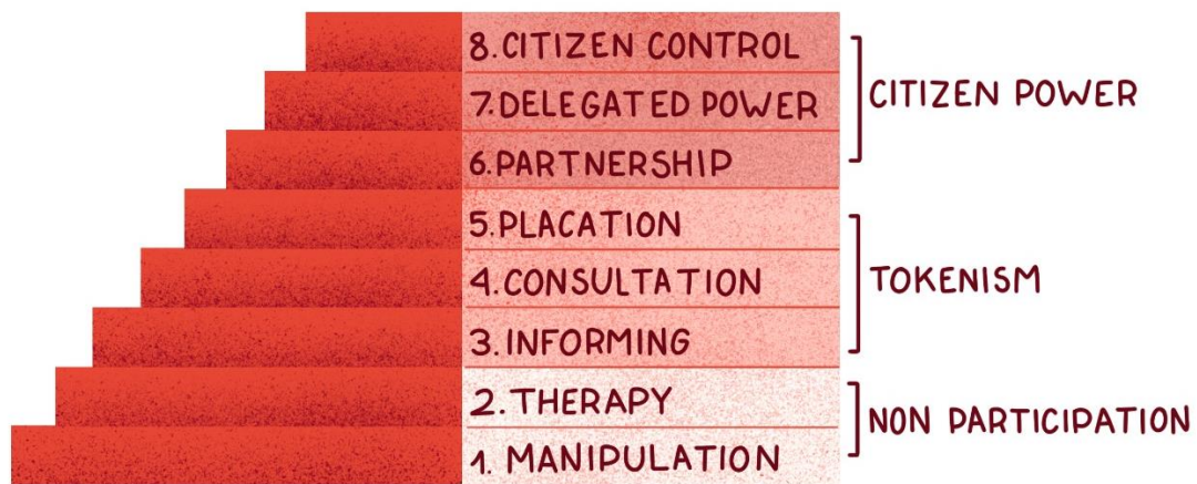
Figure 1 Arnstein's Ladder of Participation

The Core Humanitarian Standards (in following abbreviated with Core Humanitarian Standard) are a core value in the humanitarian sector reflecting sector-wide collaboration and calls for system change (Active Learning Network for Accountability and Performance in Humanitarian Action 2022; Hilhorst et al. 2021). The Core Humanitarian Standard is used as the main accountability framework for measuring quality and effectiveness of humanitarian action by putting people affected by crisis at the centre. Accountability, therein, “refers to the process of using power responsibly, taking account of, and being held accountable, by different stakeholders, and primarily those who are affected by the exercise of such power” (Core Humanitarian Standard Alliance et al. 2015, 37).